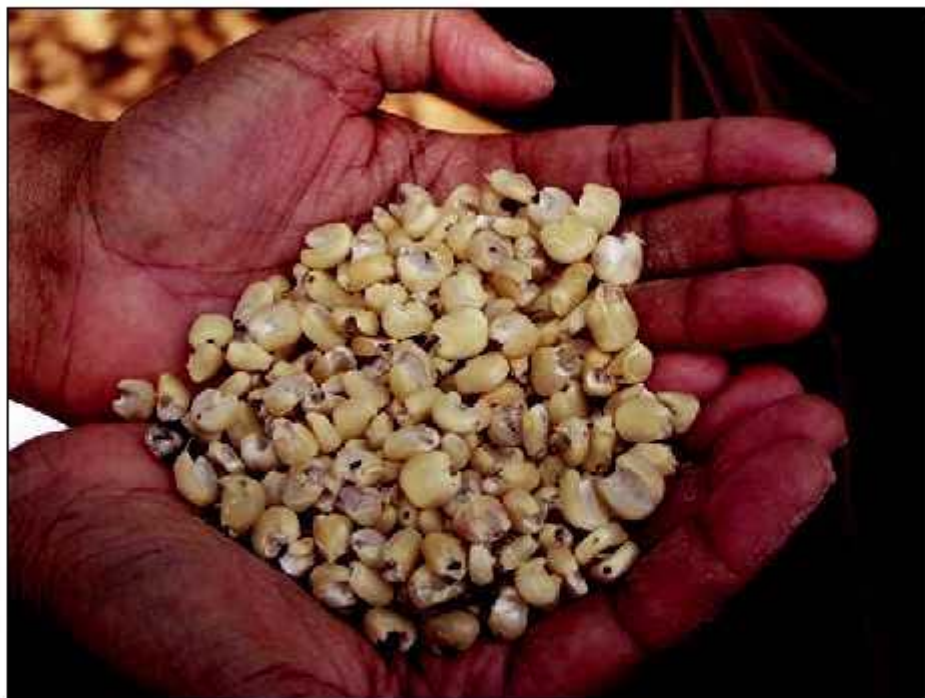
Rodents eat nearly all crops that people try to grow. This maize from a farmer's store in Tanzania has had the highly nutritious germ selectively removed by rats, making the grain useless as seed material for next year's cropping as well as reducing its nutritive quality if the remainder is consumed by people or livestock

(traps, poisons, labour) in controlling rodents.