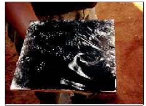
Tracking tiles are made using ordinary ceramic bathroom tiles which are blackened with soot using an oil lamp. The tracking tiles are then placed in people's homes and checked for signs of rodent activity as a way to monitor the impact of rodent management activities on the rodent population over time

sively trapping rodents. Trapping is organized at the community level, with traps rotating around the community in order to share the costs. This ensures that the rodent population is reduced at a sufficiently large enough scale to reduce the effects of immigration back into the intervention zone. In addition to the trapping programme, environmental management activities to reduce rodent access to stored food, water and harbourage within communities are demonstrated. Monitoring the impact of the EBRM intervention takes place by firstly monitoring changes to the rodent population. This is done by measuring the relative abundance of rodents in the EBRM intervention villages in comparison with non-intervention villages nearby that are simply carrying on with their indigenous rodent management activities. This comparison is done with limited removal trapping surveys and non-invasive indicators such as the placement of tracking tiles to measure overall rodent activity levels within the communities.