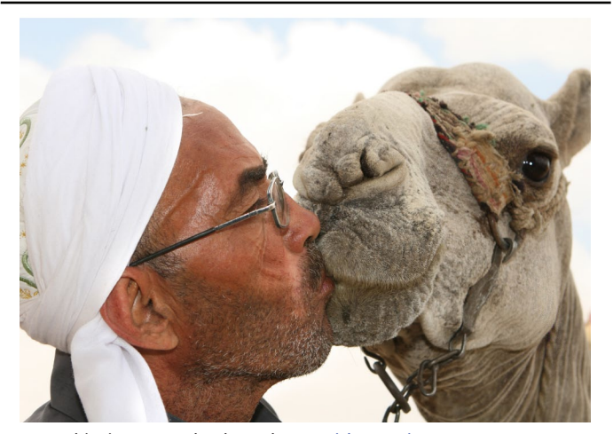
Man kissing camel.

Globally, WHO has been notified of 1149 laboratory-confirmed cases of infection with Middle Eastern Respiratory Syndrome coronavirus (MERS-CoV) since 2012, including at least 431 related deaths (crude CFR 38%). Most of those have been in Saudi Arabia,