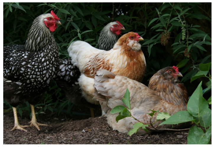
Chicken flock.

H5N2 : An outbreak was identified in a series of chicken and turkey farming operations in the Midwestern region of the USA and Canada. As of 30 May, more than 43 million birds in 15 US states had been destroyed in an attempt to stop its spread, including nearly 30 million in Iowa alone, the nation's largest egg producer. Egg prices around the country more than doubled in May.