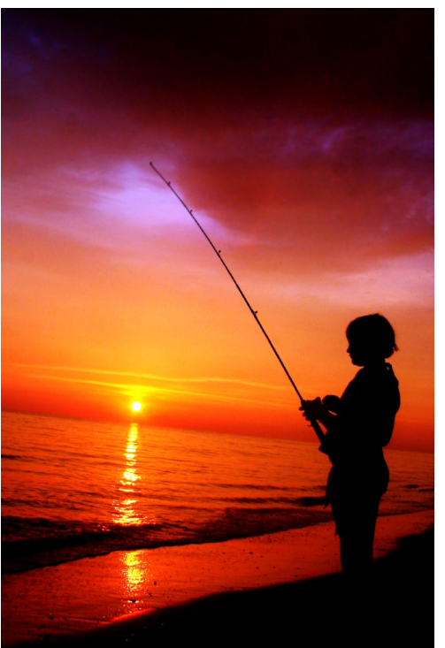
Uncertainty over seafood safety caused anxiety in coastal communities in the wake of the spill.

In order to use any potential contaminant data to