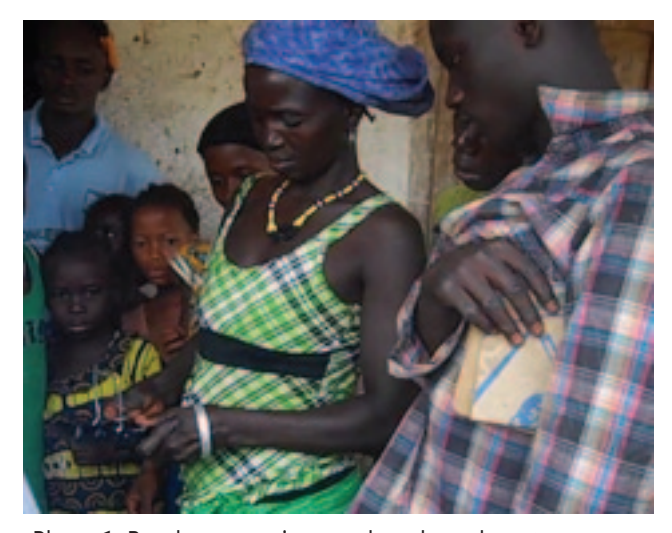
Photo 1. Rural community members learn how to use new technology traps as part of StopRats demonstration activities about intensive trapping for managing rodents in households.