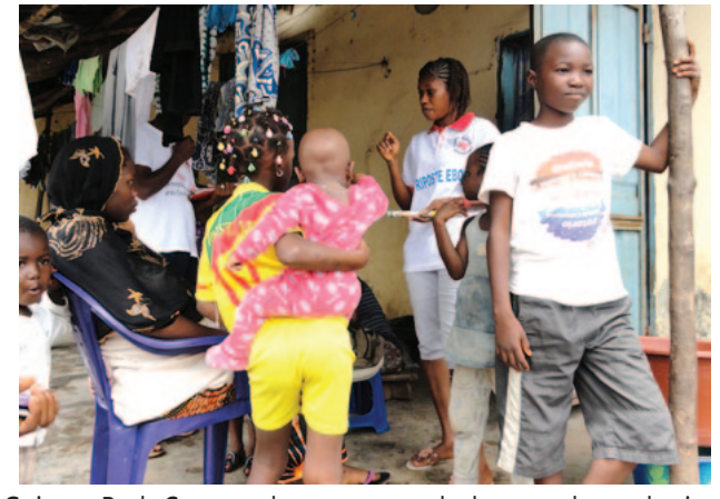
Guinea Red Cross volunteers travel door-to-door sharing information about Ebola.

The good news about this terrible epidemic is that Liberia was declared Ebola-free as of 9 May 2015, 42 days (2 incubation periods) after the last known case, with a final total of 10 666 cases & 4806 deaths, of which 3151 cases were confirmed; the number of confirmed deaths is not yet available. The bad news is that since the week ending 10 May 2015, when a