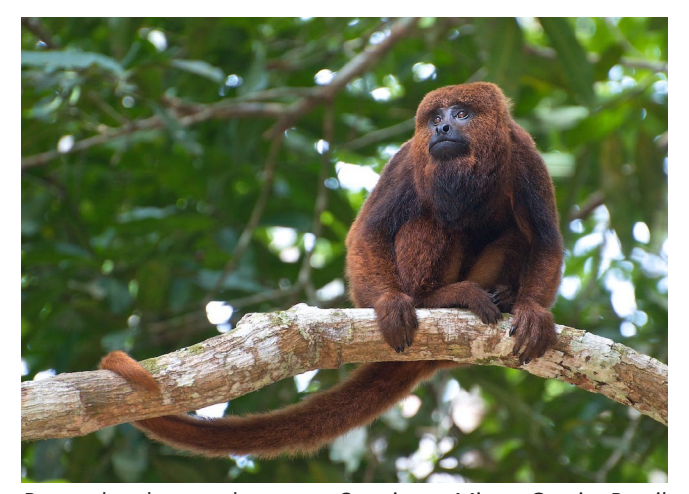
Brown howler monkey near Caratinga, Minas Gerais, Brazil.

Yellow fever (YF) seems to break out in the central Brazilian forest (not just in the Amazon) in approximately seven-year cycles, long enough for howler monkey populations to recover from their mortality in the previous epizootic. Brazil reported no cases of YF in 2014, but a few monkey carcasses were found in a forest in Tocantins state that year, indicating that YF