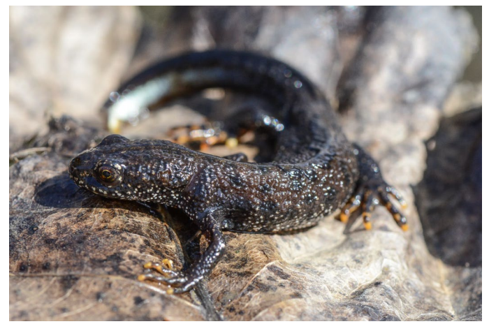
Great crested newts, native to the UK, could be in danger if chytrid fungus spreads to wild populations.

around 300 unique species of frogs. The pathogen is classified as one of the greatest threats to biodiversity worldwide.