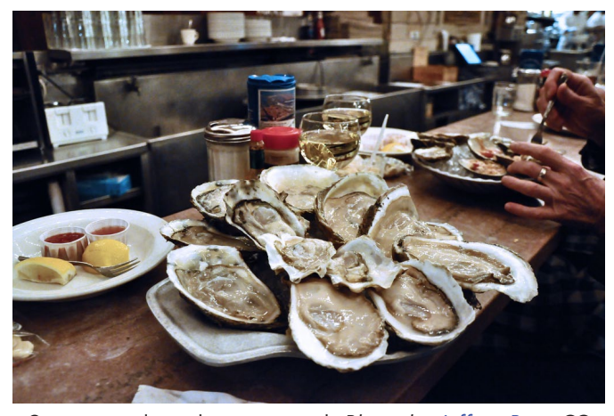
Oysters ready to be consumed.

Verde (islands off the west coast of Africa) in March for the first time since 2009. There were also first reports of lumpy skin disease in cattle in Saudi Arabia, and an oyster disease, Bonamiosis, in Denmark. A different oyster disease, perkinsosis, caused an outbreak in Australia.